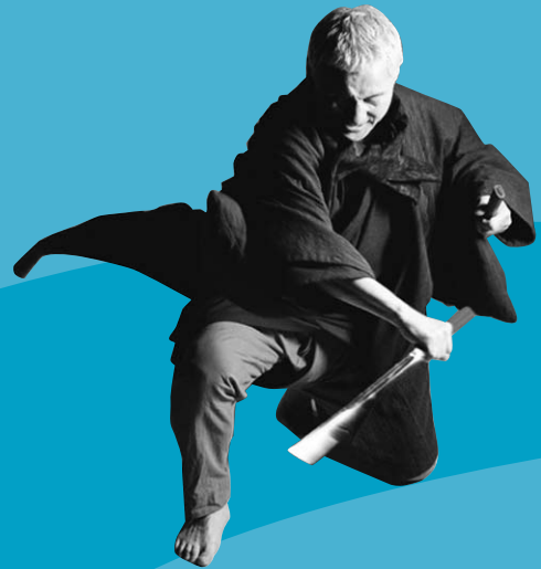
Above: Takeshi Kitano as Zatoichi

Please note. Admission to all unclassified films is restricted to people 18 years and over.