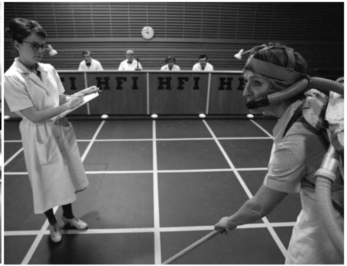
Clockwise from top left: Agatha and the Storm, Ray and Kitchen Stories.

When news comes that Marina's brother Otar has been killed while working in France, Marina and Ada decide to conceal his death rather than break Eka's heart. Otar's death amplifies the fantasies, failings and buried aspirations each woman had projected onto his mythic achievements and ultimately becomes a catalyst for change. – Filmink